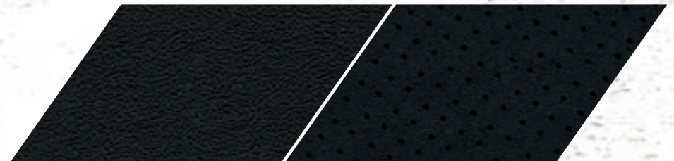
LAGUNA LEATHER TRIM WITH LAGUNA AXIS II PERFORATED INSERTS, BLACK – STANDARD ON SRT® 392 AND SRT® HELLCAT