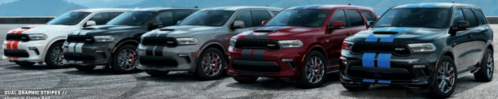
..... DUAL GRAPHIC STRIPES // shown in Flame Red.