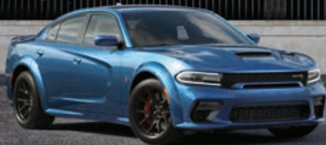
CHARGER SRT HELLCAT // shown in Frostbite.

We've always been devoted to distancing ourselves: from the pack, from the competition, from the mundane and – most importantly – from convention. Every Dodge in our 2023 lineup is designed to deliver something decidedly unique: fierce attitude, formidable horsepower and intense performance.