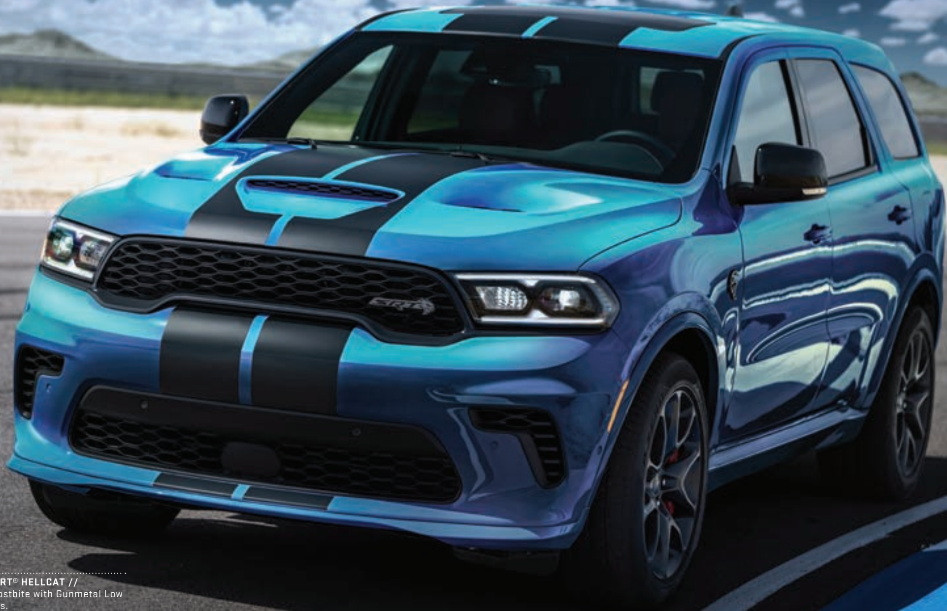
..... DURANGO SRT® HELLCAT // shown in Frostbite with Gunmetal Low Gloss Stripes.