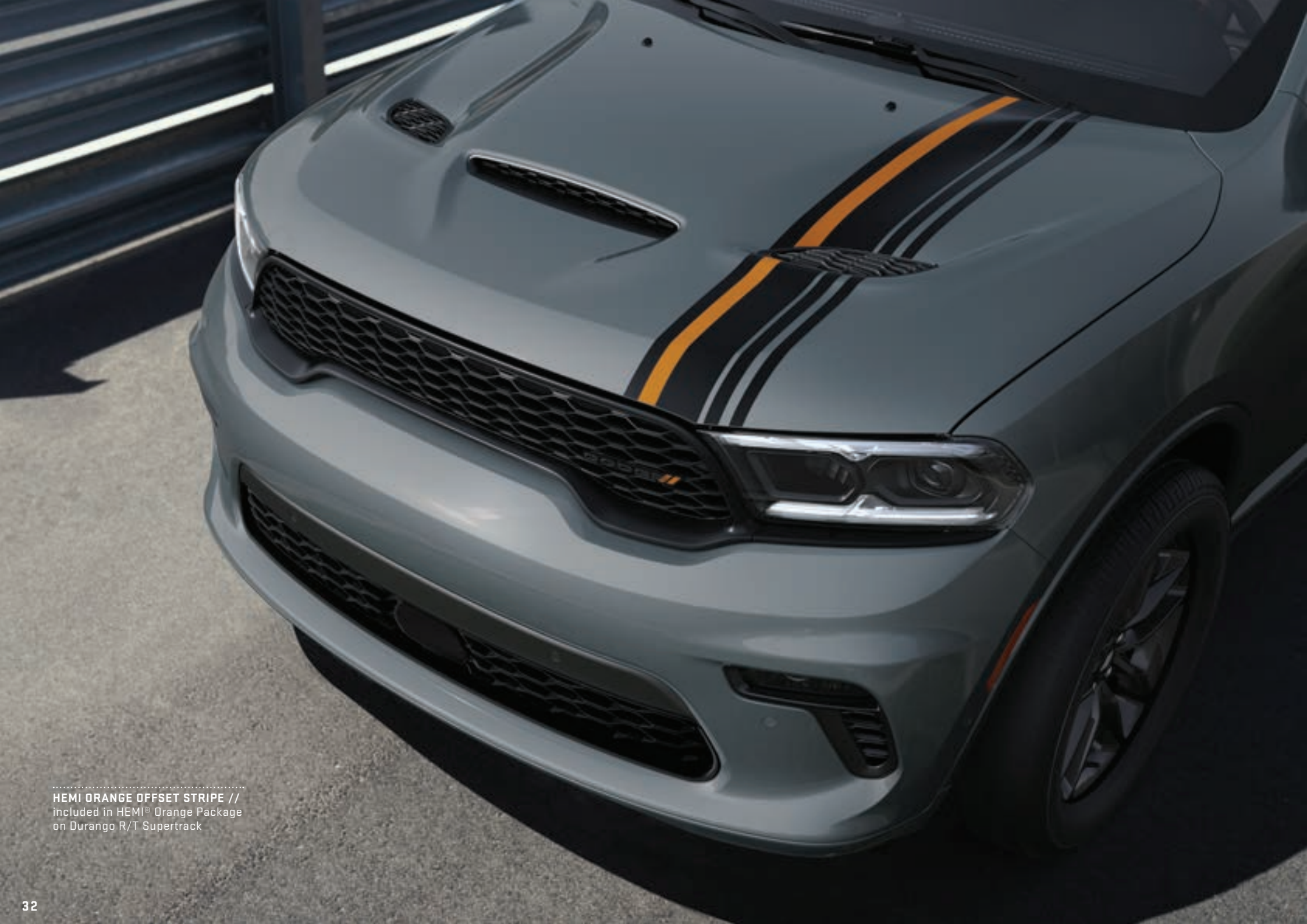
..... HEMI ORANGE OFFSET STRIPE // included in HEMI® Orange Package on Durango R/T Supertrack