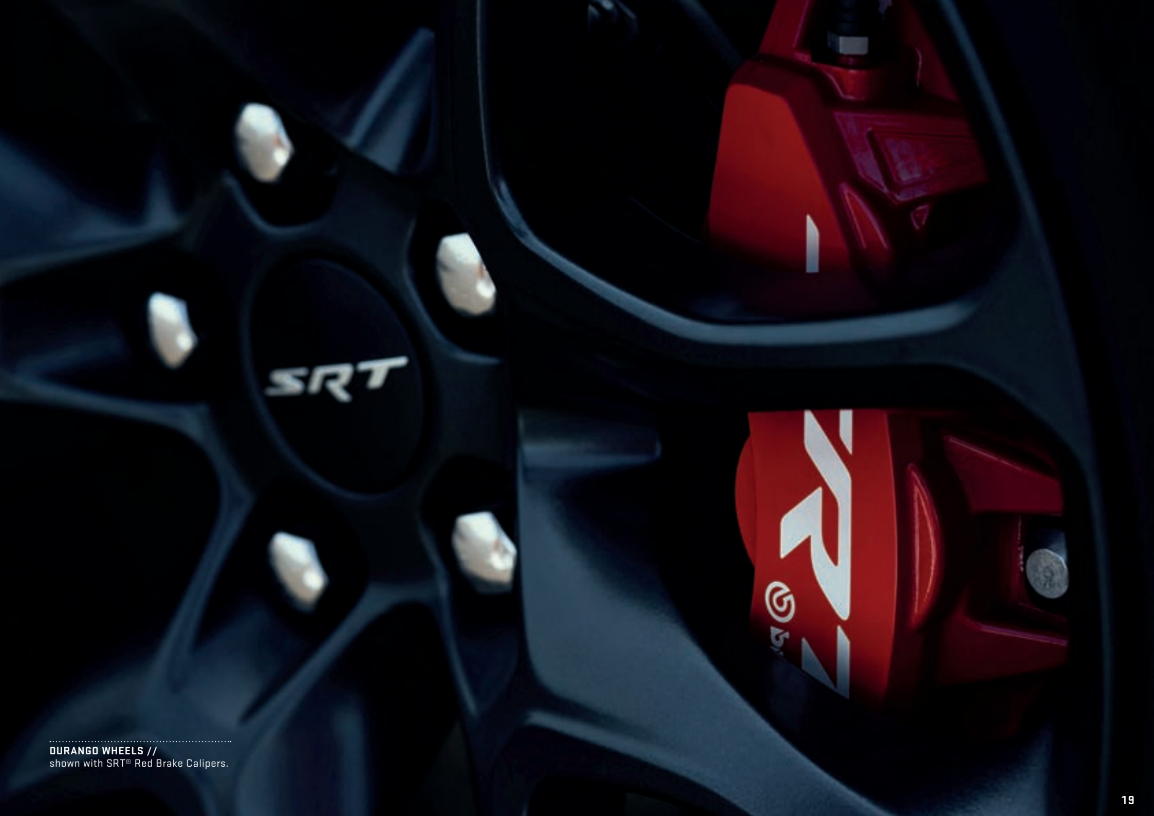
..... DURANGO WHEELS // shown with SRT® Red Brake Calipers.