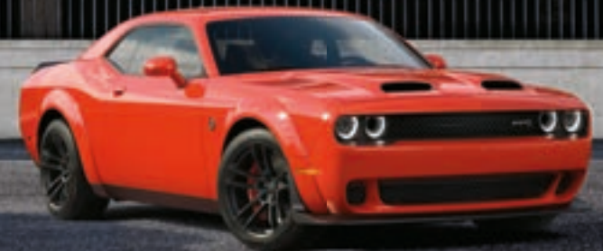
CHALLENGER SRT HELLCAT // shown in GoMango.