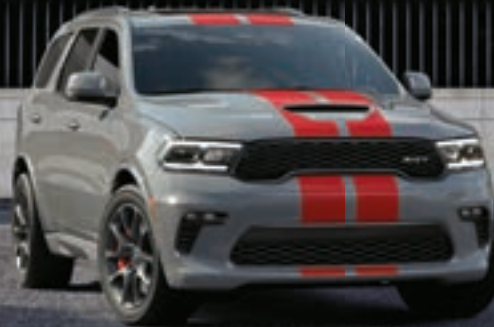
DURANGO SRT // shown in Destroyer Grey.