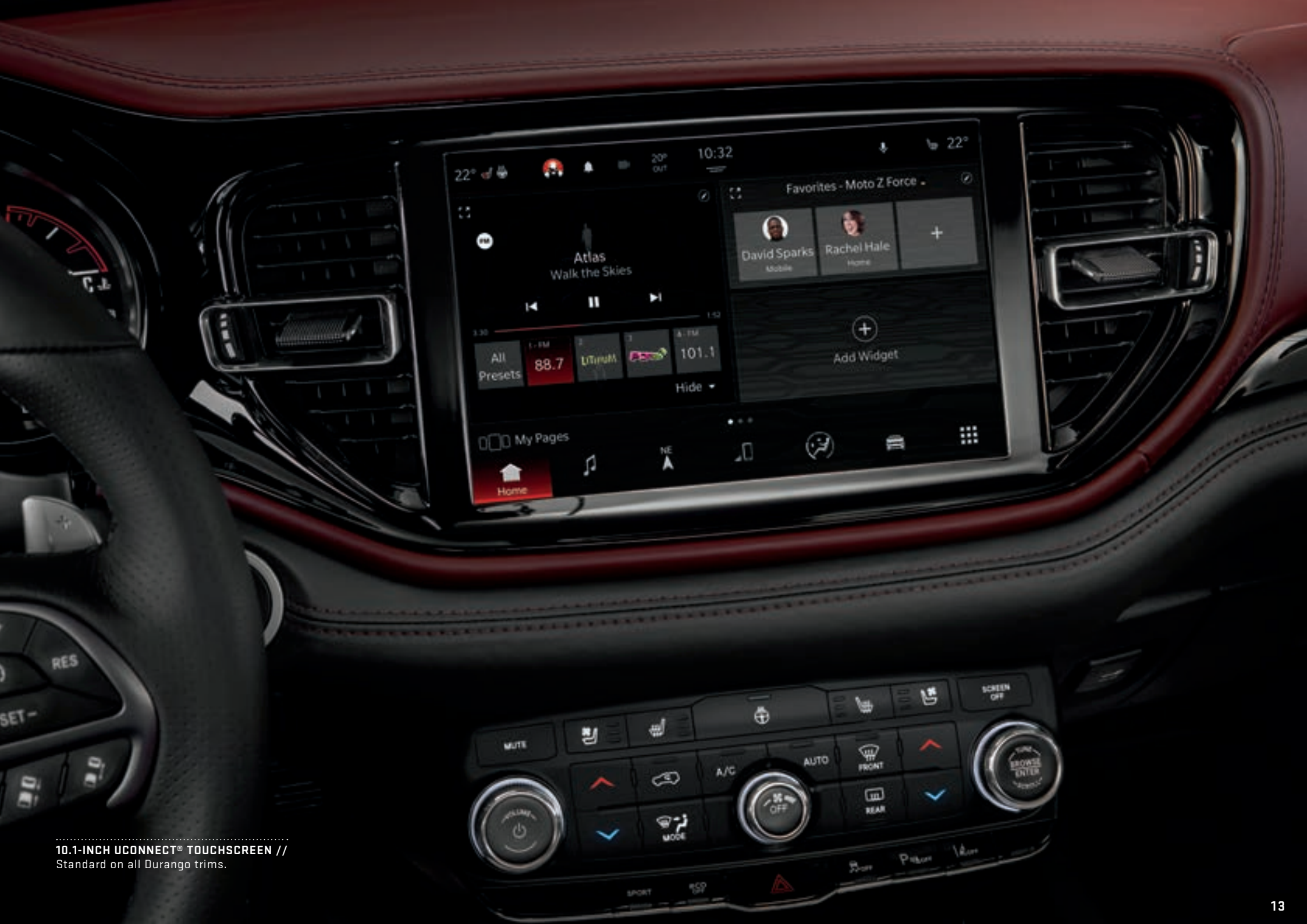
10.1-INCH UCONNECT® TOUCHSCREEN // Standard on all Durango trims.