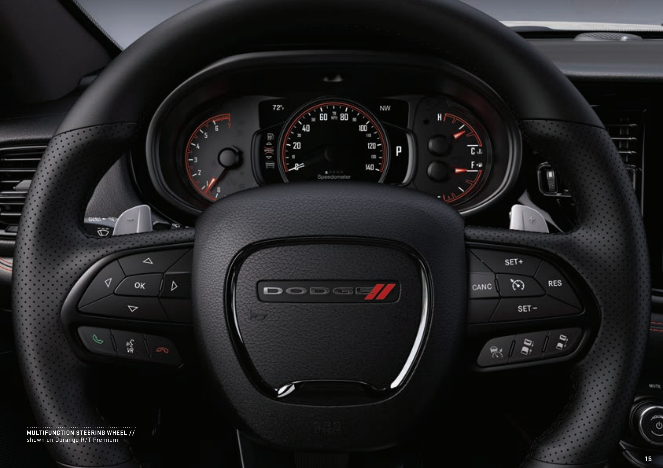
MULTIFUNCTION STEERING WHEEL // shown on Durango R/T Premium